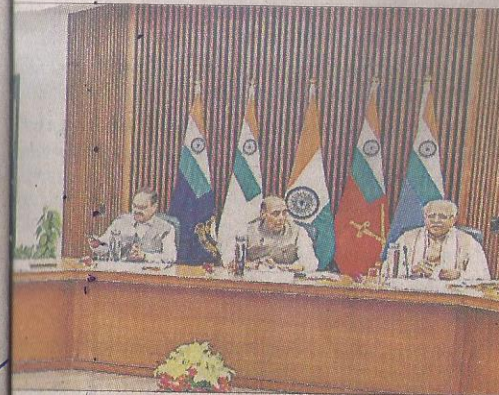
(right) chairs a meeting of the informal group of est Asia, in New Delhi on Wednesday